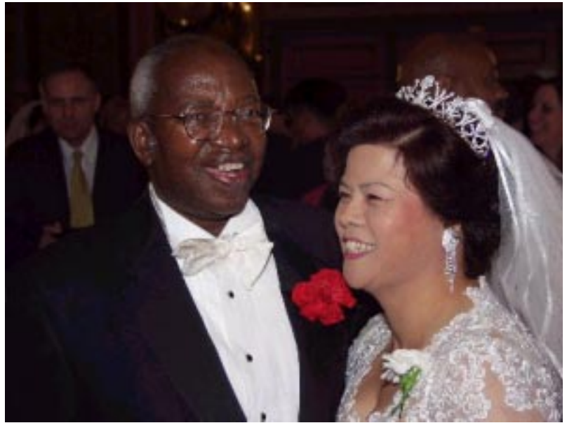
Archbishop Milingo and wife Maria Sung at their wedding reception last year.

Yet Milingo's continued absence since that meeting has caused continued concern. There have been rumors that the Archbishop's health is not good. The Catholic Church refuses to reveal Milingo's whereabouts. No public communication from him has been forthcoming. Some have