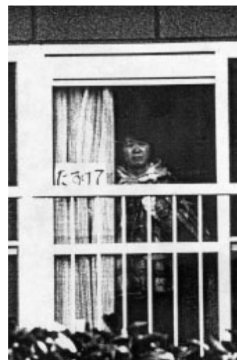
Confined Japanese believer pleads for "help" from passersby.

While the Japanese courts thus refuse to protect the freedom of Unificationists to believe and practice their religious faith, ex-members of the church receive lucrative judgments. On August 22, another court granted damages of 9