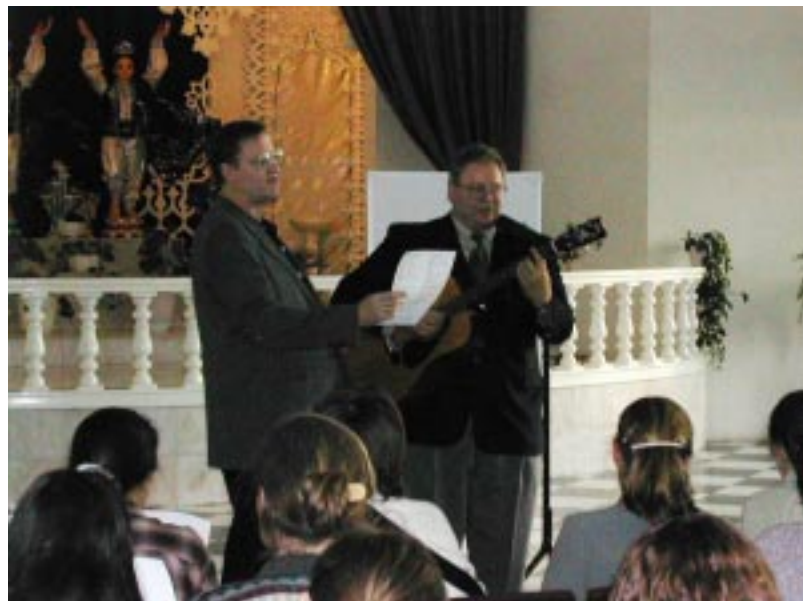
Leading songs with "J" at Krishna temple in St. Petersburg

Those same mixed emotions of hope and fear remain with me today as I consider the future of religious freedom and human rights in Eastern Europe.