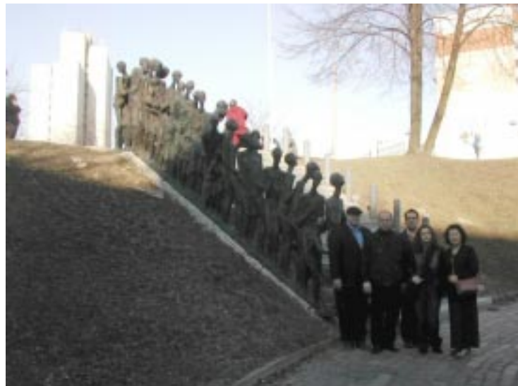
The author (at left) with Belarusian friends at a Holocaust memorial in Minsk.

The occasion of my pilgrimage to Vilnius was the annual conference of the Center for Studies on New Religions (CESNUR). As usual, the conference provided a valuable opportunity to hear the latest research by scholars on new religious movements (NRMs), renew old friendships, and learn about the situation of religious freedom both from